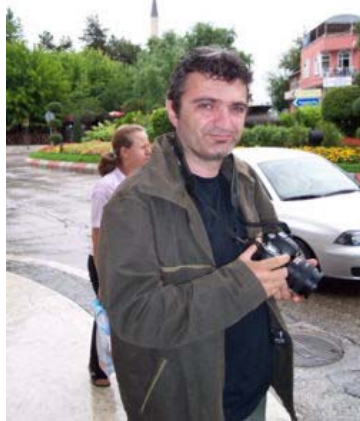
Pictured: Omer Asan

The Turkish writer, Omer Asan was born in 1961 in Trebizond, a city in Pontos where even today one can find many Greek speaking inhabitants. It is where an aging community still speaks the Pontian language.